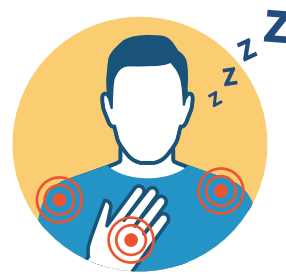
MUSCLE PAIN AND FATIGUE