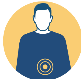
NAUSEA OR VOMITING